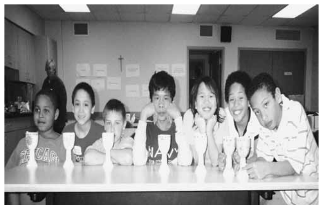
RCIC-Rite of Christian Initiation of Children on Annual Retreat

Correction from last Sunday – The answer to question 2 concerning the Council of 1545 should have been C – Trent. We are sorry for the error.