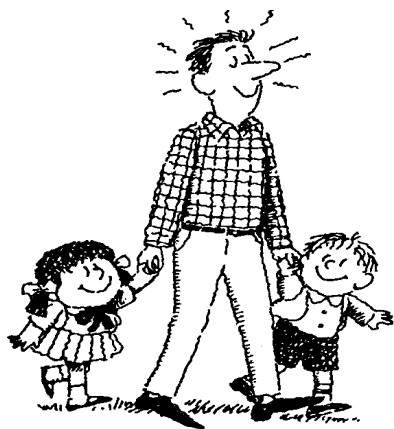
Happy Father's Day!