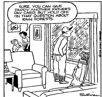
from The Joyful Noiseletter ©Ed Sullivan Reprinted with permission

Ticket returns can be made to the ushers or placed in the collection basket at Mass.