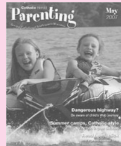
Photo Contest 2007

“In 1492 Columbus sailed the oceans blue.” This rhyme was meant to help children learn when Christopher Columbus set sail to find a passage to India. He left Spain using three ships – the Nina, the Pinta, and the Santa Maria on August 3. It was very brave but he knew God would be with him and the crew. Would you like to discover a new land, maybe on a different planet?